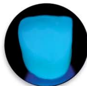
Ceramco PFZ Porcelains Mimic Natural Tooth Fluorescence